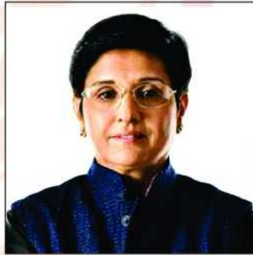
Chief Guest: Dr. Kiran Bedi Social Activist Ramon Magsaysay Awardee